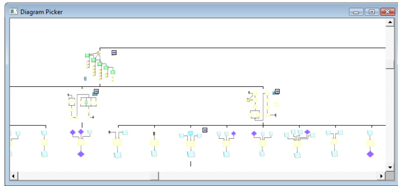
Above: Diagram Picker